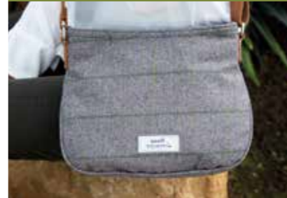
Heritage Tweed Pages 60-67