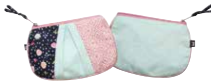
Blue Floral Pastel Pleat Purse PASPURBL