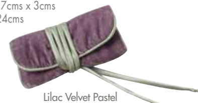
Lilac Velvet Pastel Jewellery Roll V2OJRMINT