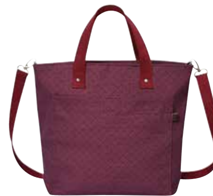
Plum Floral Canvas Tote Bag NVTIPL