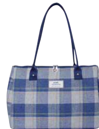
Loch Tweed Tote Bag T21EMTTLO