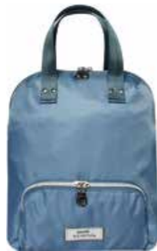
Pale Blue Small Voyage Backpack YAGSMBL

The Voyage range is lightweight and practical – and updated for 2021 with brand new colours and styles