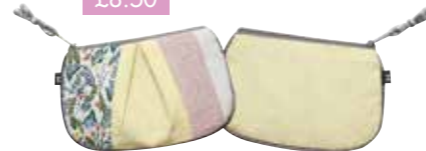
Yellow Floral Pastel Pleat Purse PASPURYW