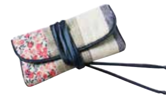
Pink Floral Pastel Jewellery Roll PASJRPK