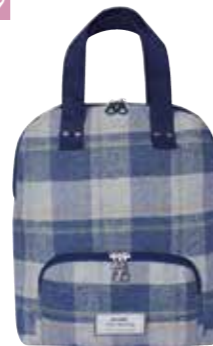
Loch Tweed Alice Backpack T21BKPLO