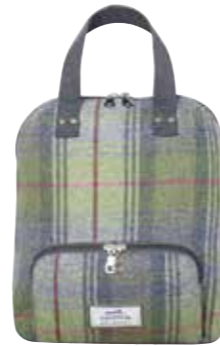
Pebble Tweed Alice Backpack T21BKPPB