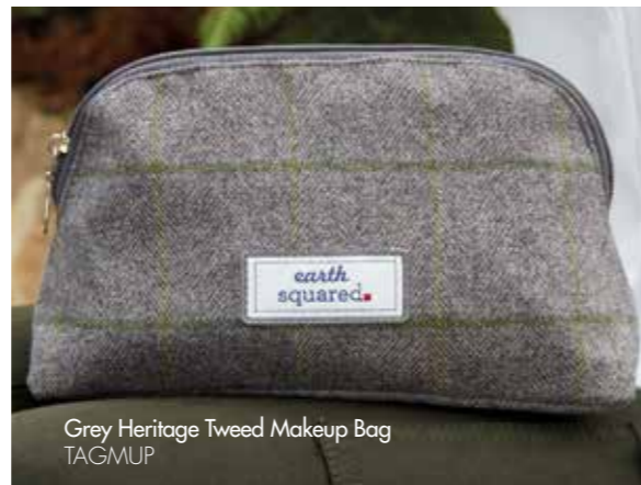
Grey Heritage Tweed Makeup Bag TAGMUP