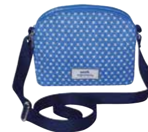
Blue/White Spring Linen Half Moon Bag XMOONBL