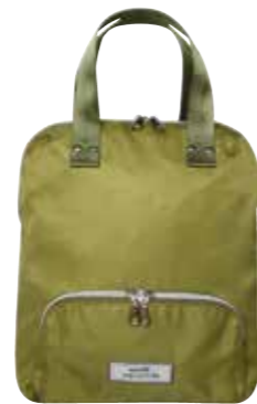
Green Small Voyage Backpack YAGSMGN