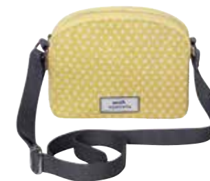
Yellow/White Spring Linen Half Moon Bag XMOONYW