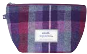
Glen Tweed Makeup Bag T21MUPGLE