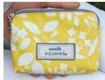
Sherbet Yellow Oil Cloth Anne Purse YELANN

With a single zipped compartment and fabric card divider inside.