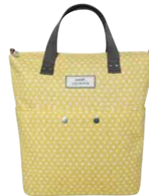
Yellow/White Spring Linen Backpack XBPYW