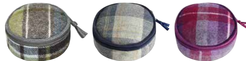
Wisteria Tweed Jewellery Pouch TDJRGP