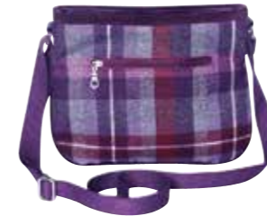
Glen Tweed Rosy Bag T21ROSGLE