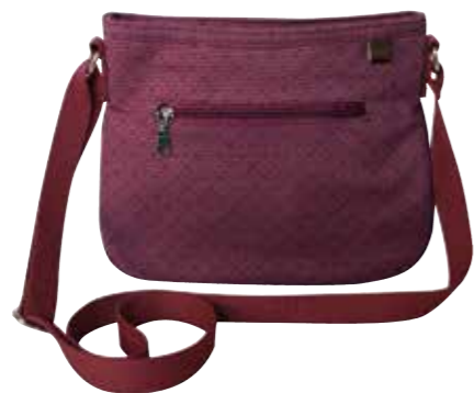
Plum Floral Canvas Rosy Messenger Bag NVRMPL