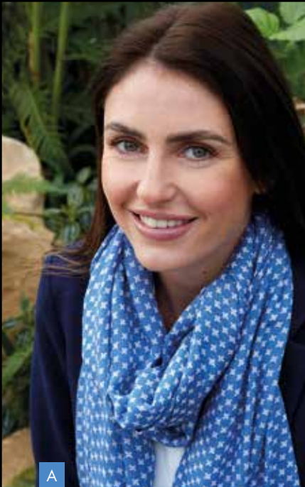
A Blue/White Spring Cross Scarf XSCFBL