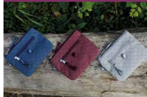
Floral Canvas Pages 54-58