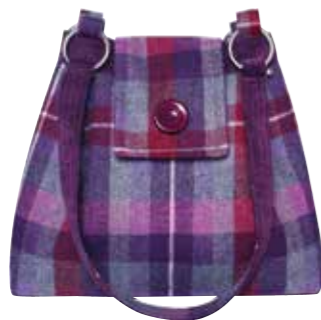
Glen Tweed Ava Bag T21AVAGLE

With a deceptively spacious interior the Ava is fully lined with mobile phone pouch and internal zipped pocket. The magnetic closure has a large colour matched button and the slightly longer straps allow for comfortable positioning over your shoulder.