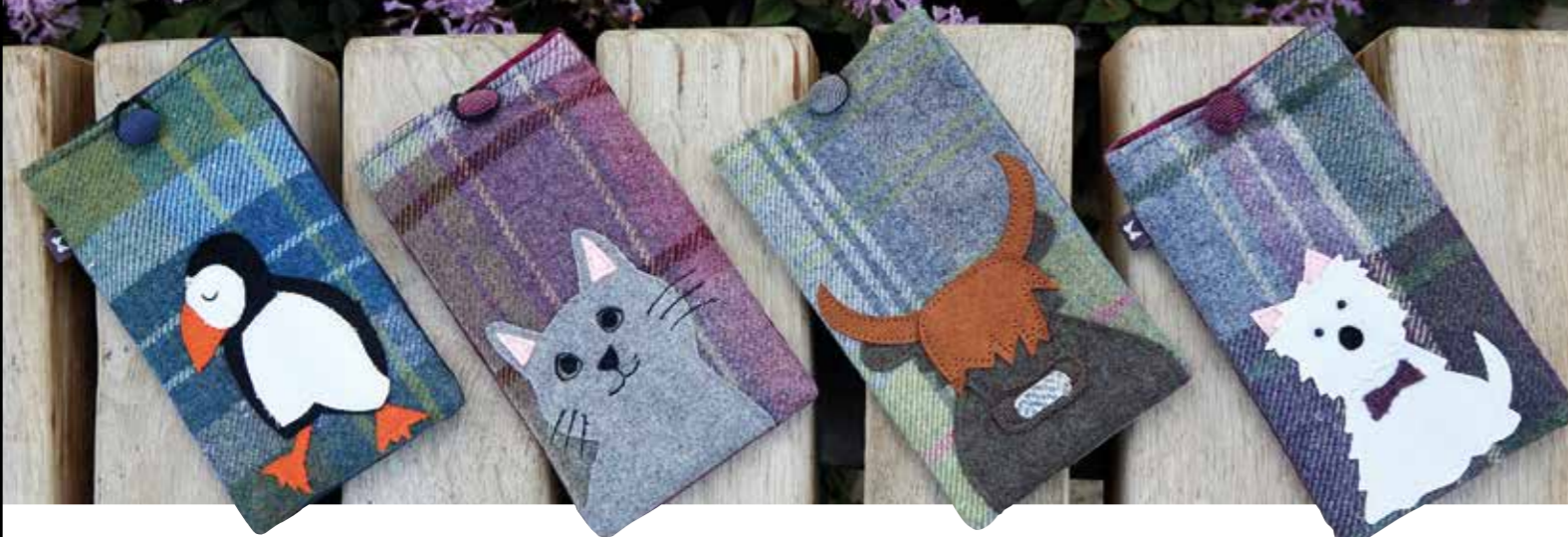
Puffin Appliquéd Eye Glass Case PPQEYPUF