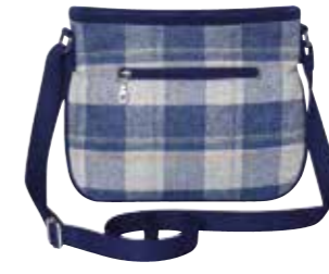
Loch Tweed Rosy Bag T21ROSLO