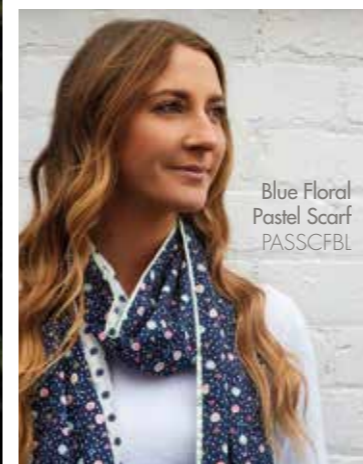
Blue Floral Pastel Scarf PASSCFBL