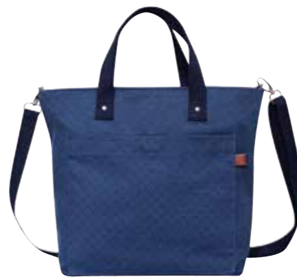
Blue Floral Canvas Tote Bag NVTINY