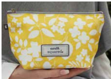
Sherbet Yellow Oil Cloth Makeup Bag YELMUP