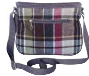
Wisteria Tweed Rosy Bag T21ROSGP

With cord piping and cotton webbing cross body strap. Available in four beautiful new seasonal shades.