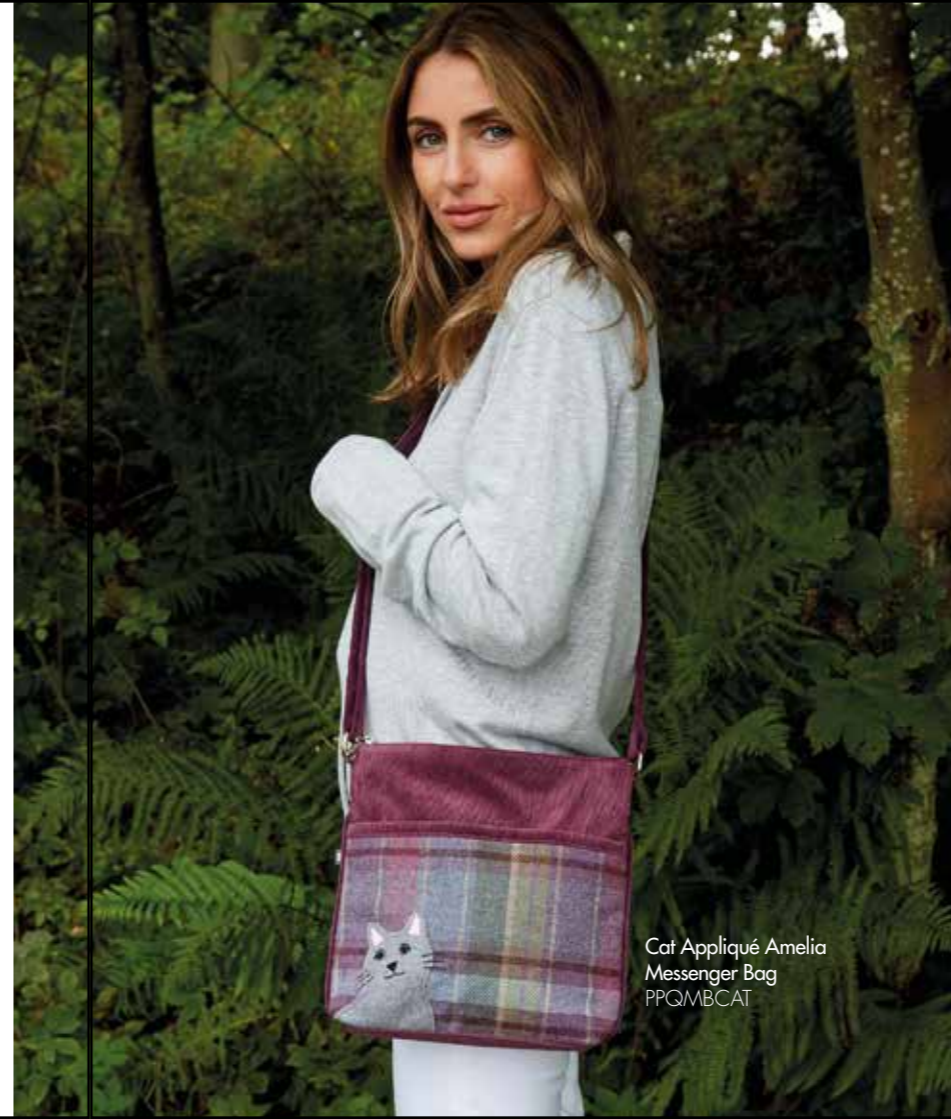
Cat Appliqué Amelia Messenger Bag PPQMBCAT