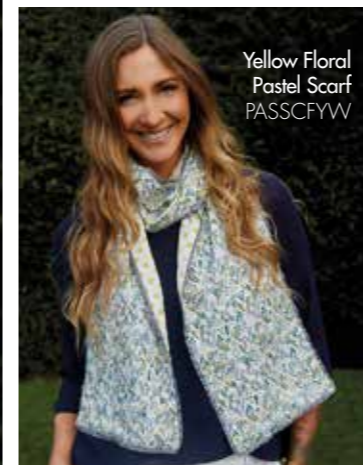
Yellow Floral Pastel Scarf PASSCFYW