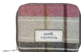
Wisteria Tweed Wallet T21WLGP