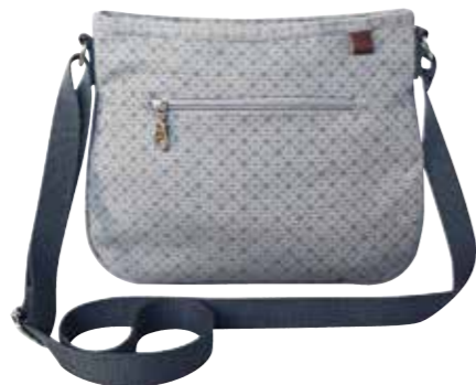
Grey Floral Canvas Rosy Messenger Bag NVRMG