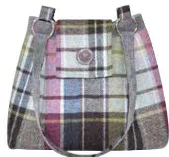
Wisteria Tweed Ava Bag TDAGP