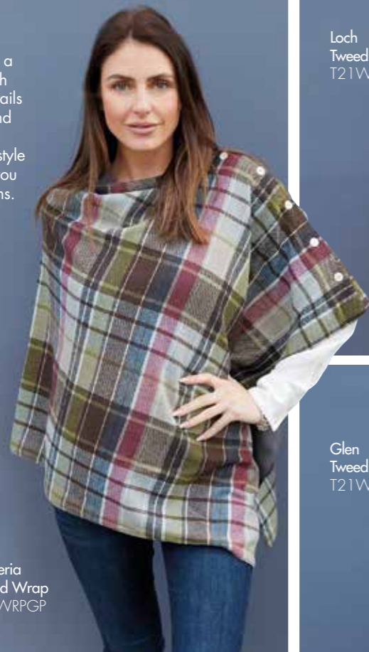
Wisteria Tweed Wrap T21WRPGP