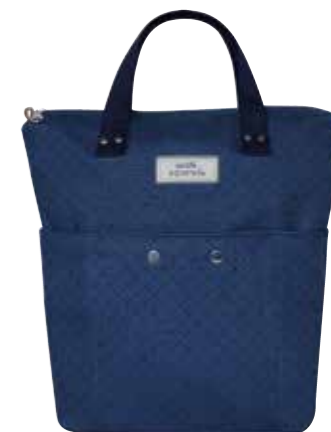
Blue Floral Canvas Backpack NVBPNY