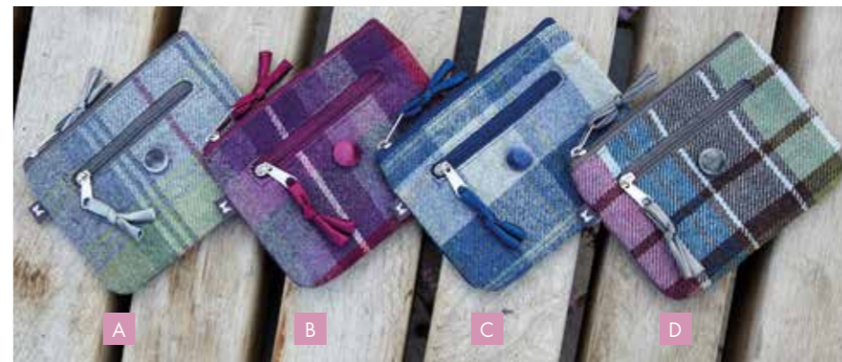
A Pebble Tweed Emily Purse T19EMPB