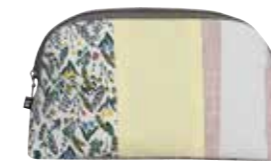
Yellow Floral Pastel Make Up Bag PASMUBYW