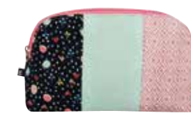
Blue Floral Pastel Make Up Bag PASMUBBL