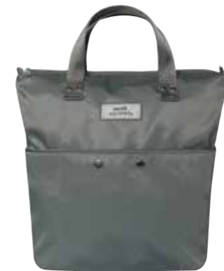
Grey Voyage Billie Backpack YAGBPGY