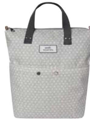
Grey/White Spring Linen Backpack XBPGY