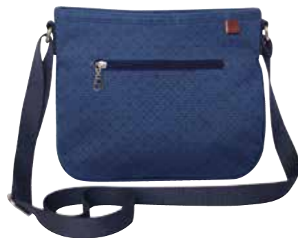
Blue Floral Canvas Rosy Messenger Bag NVRMNY