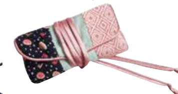
Blue Floral Pastel Jewellery Roll PASJRBL