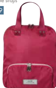
Pink Small Voyage Backpack YAGSMPK