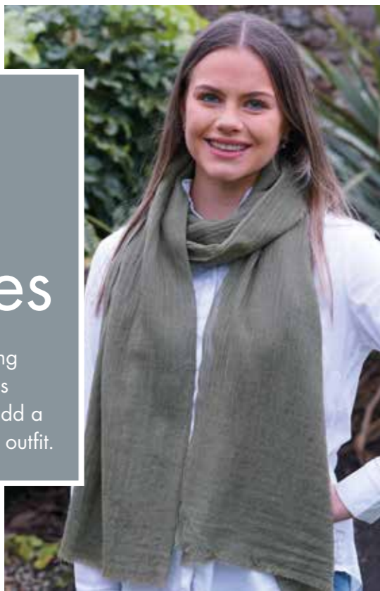
Green Wool & Silk Blend Scarf PSGREEN