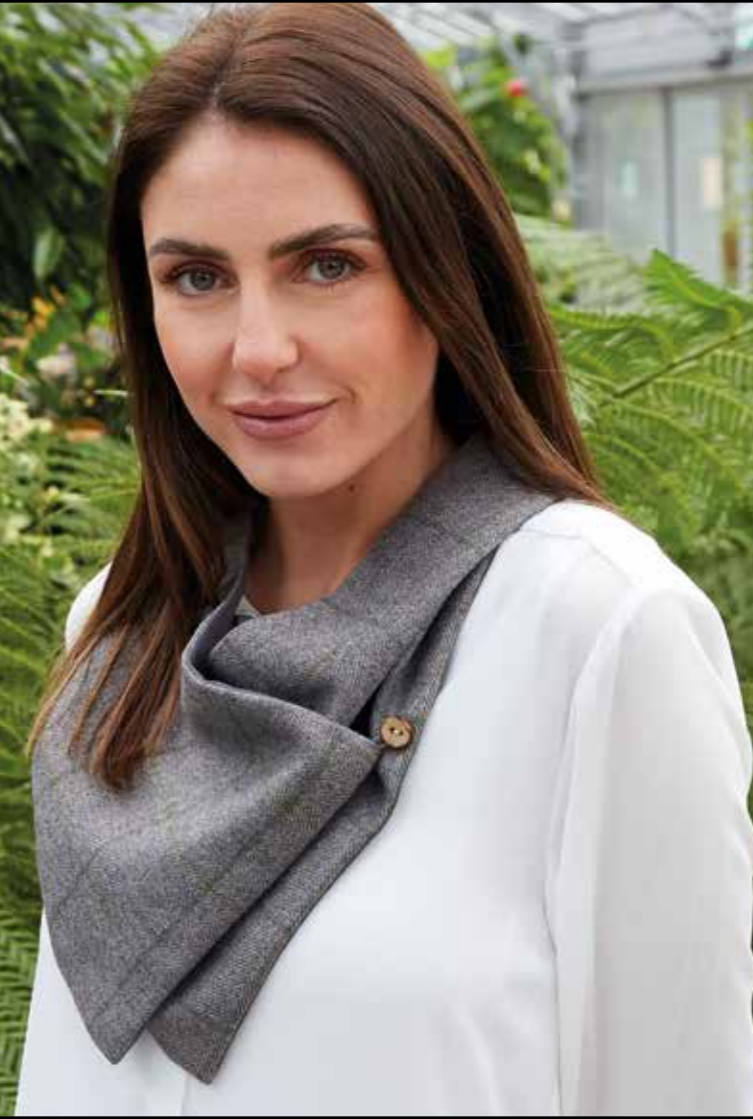
20cms x 93cms £23.99