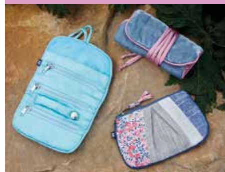
Floral Pastels Pages 32-35