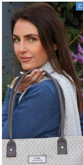
C Grey/White Spring Cross Scarf XSCFYW