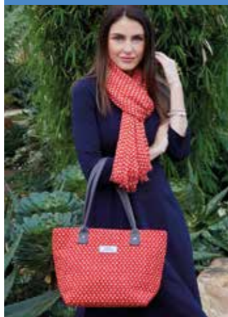
Spring Linen Pages 12-18