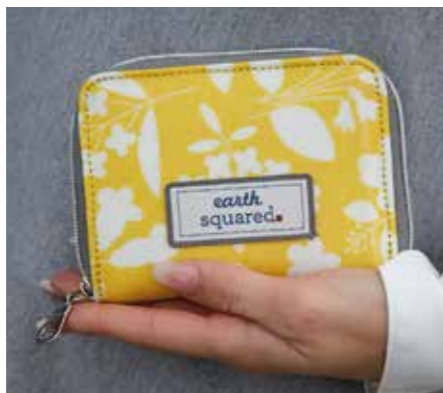
Sherbet Yellow Oil Cloth Wallet YELVAL