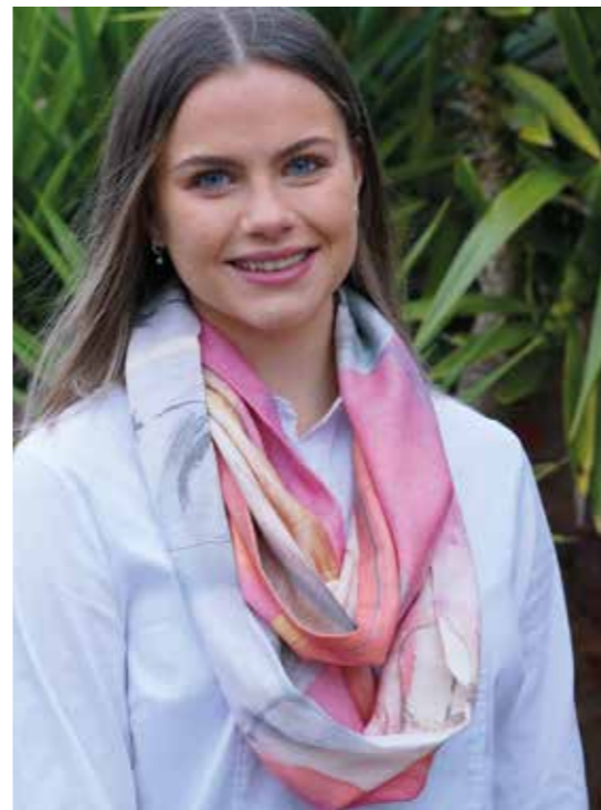
Sorbet Antibes Scarf ANTSOR