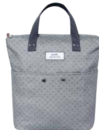
Grey Floral Canvas Backpack NVBPG