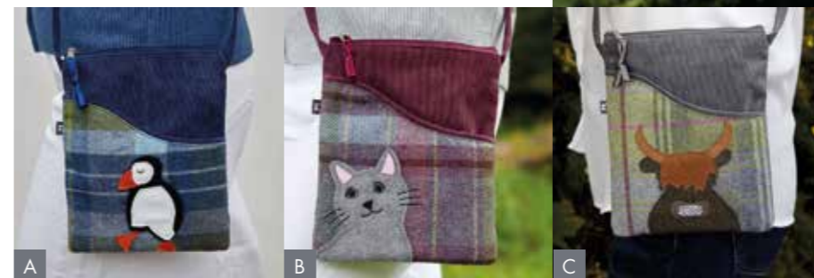
A Puffin Appliquéd Sling Bag PPQSLPUF

This simple design has a long cross body strap, zipped main compartment and front slip pocket with interesting curved edge.