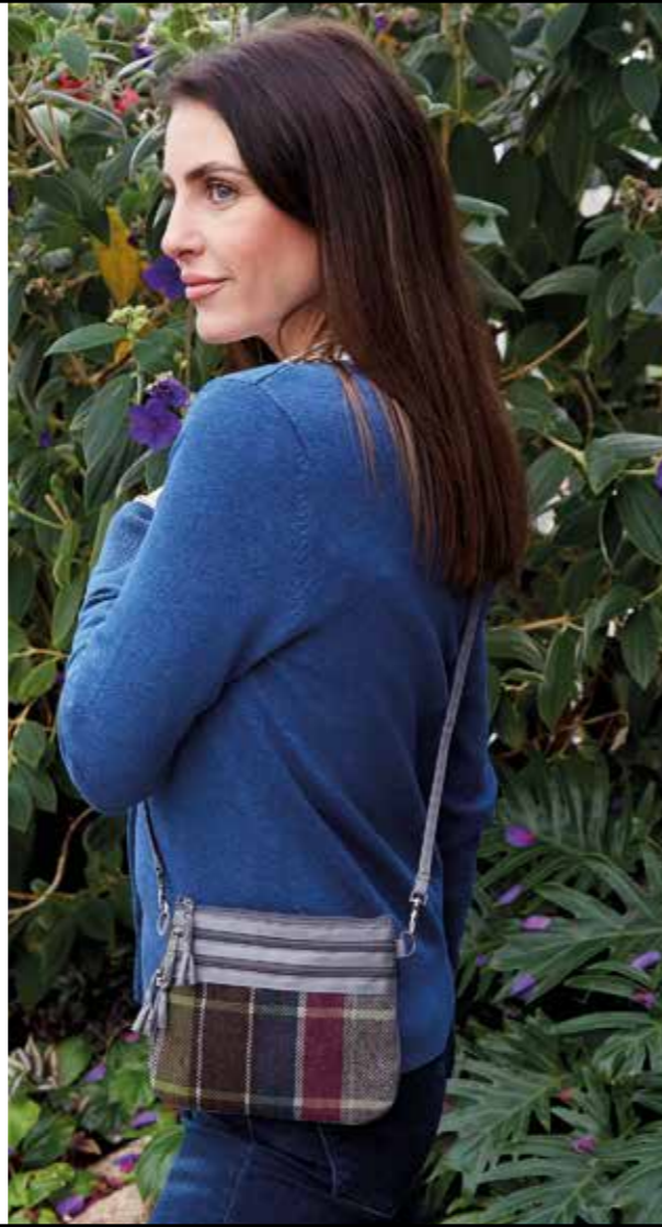
Glen Tweed Pouch Bag T21PCHGLE