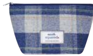
Loch Tweed Makeup Bag T21MUPLO