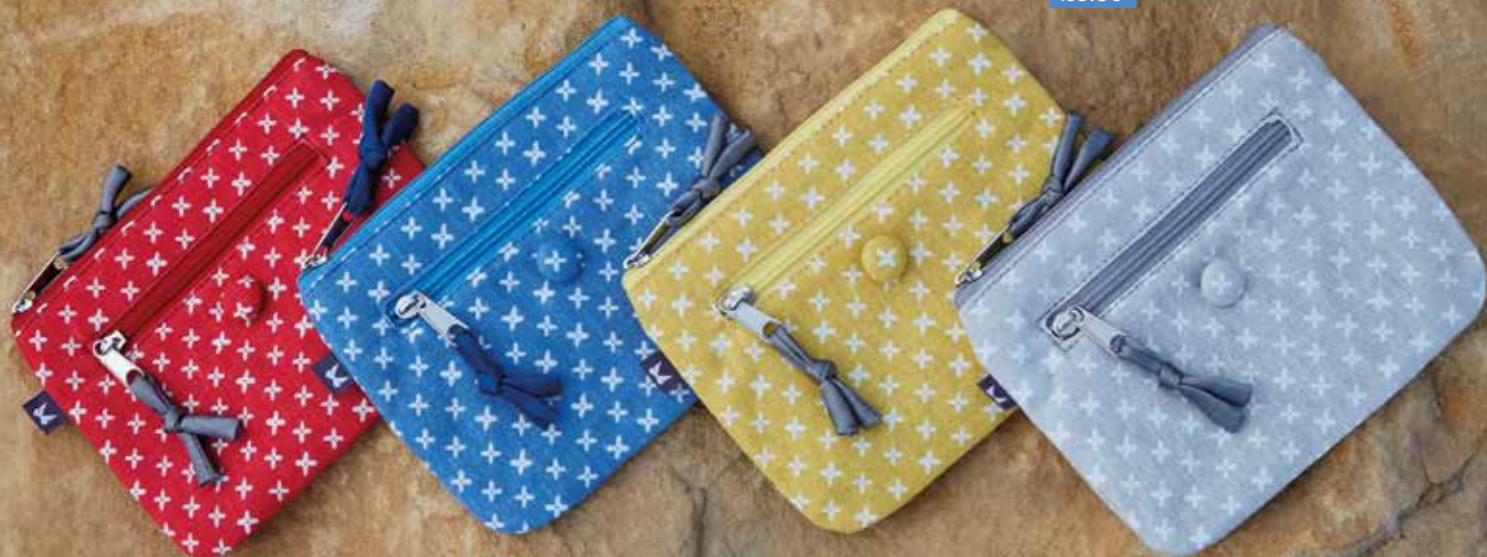
Red/White Spring Linen Emily Purse XEMPRD