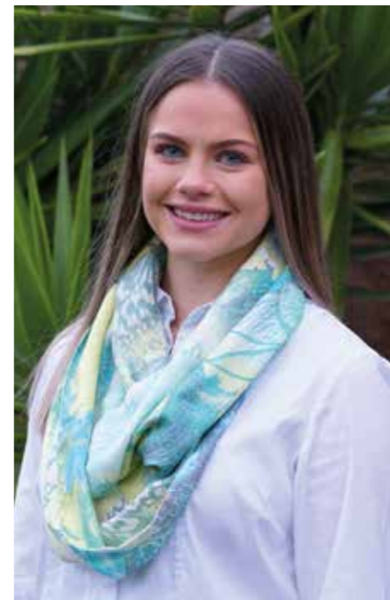
Lemon Antibes Scarf ANTLEM