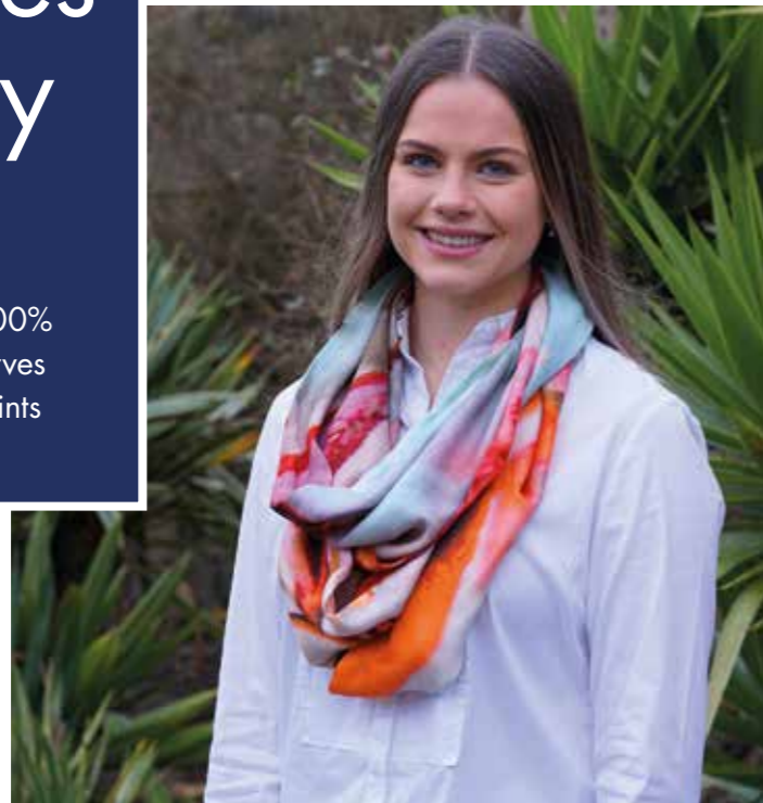
Island Antibes Scarf ANTISL