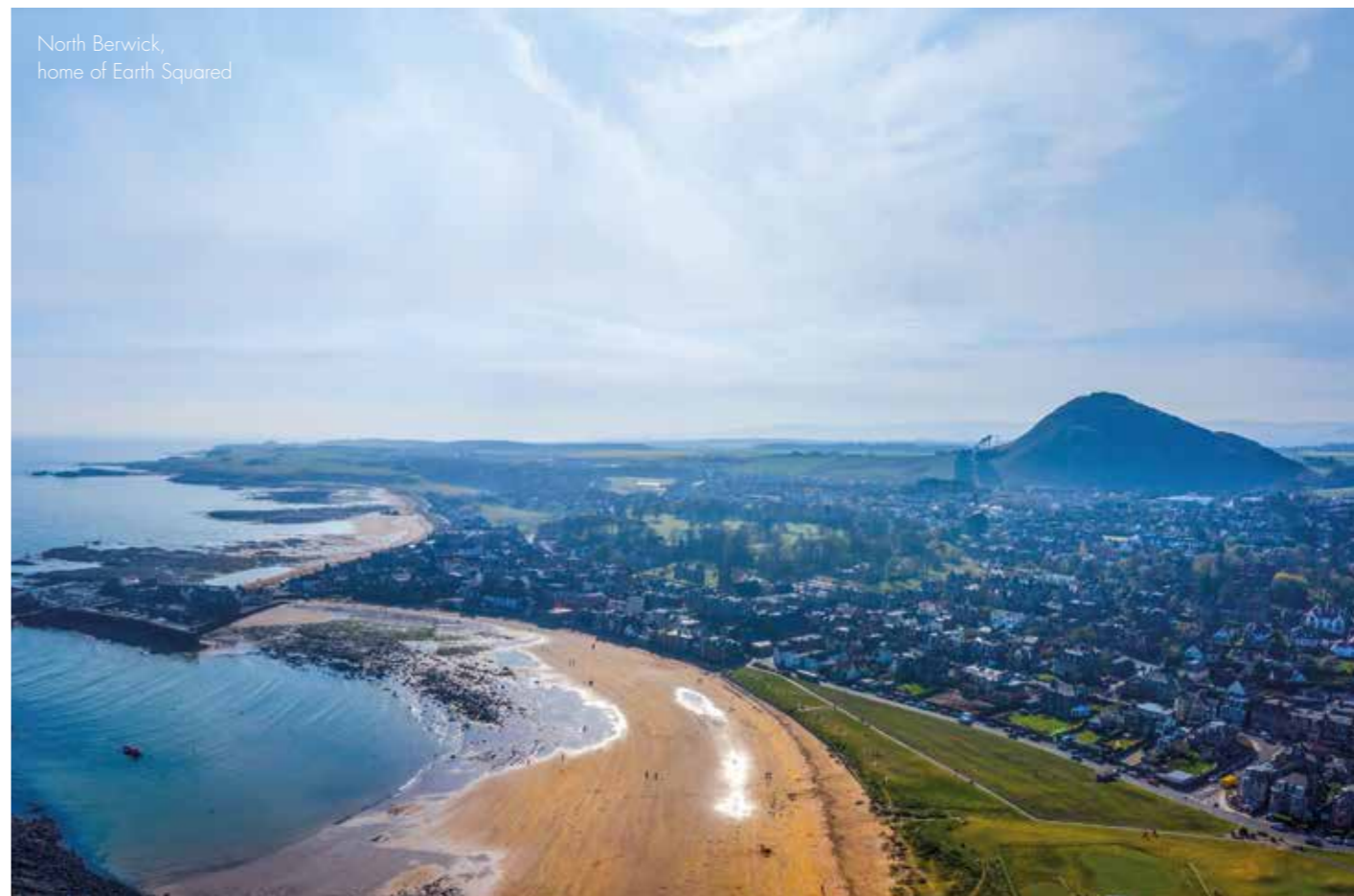
North Berwick, home of Earth Squared