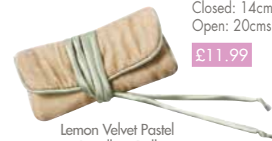
Lemon Velvet Pastel Jewellery Roll V2OJRELM