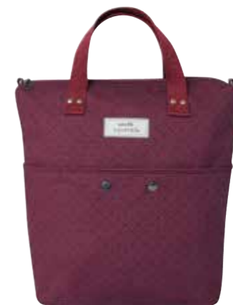
Plum Floral Canvas Backpack NVBPPL