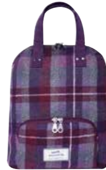
Glen Tweed Alice Backpack T21BKPGLE