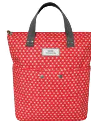
Red/White Spring Linen Backpack XBPRED