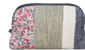
Pink Floral Pastel Make Up Bag PASMUBPK