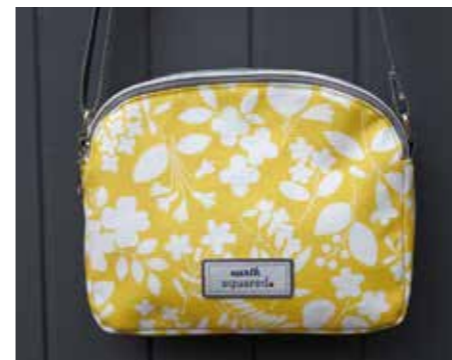
Sherbet Yellow Oil Cloth Half Moon Bag YELMOON

Available in this sunshiny yellow and white floral design.