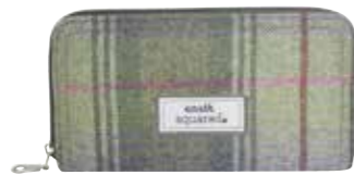
Pebble Tweed Wallet T19WALPB 21cms x 10cms