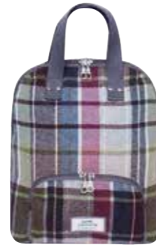
Wisteria Tweed Alice Backpack T21BKPGP