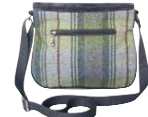
Pebble Tweed Rosy Bag T21ROSPB

28cms x 22.5cms x 7cms Strap: adjustable 74cms-140cms