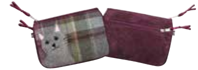
Cat Appliqué Juliet Purse PPQJPCAT