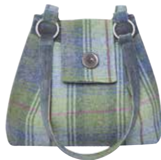
Pebble Tweed Ava Bag T19AVAPB