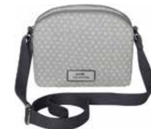
Grey/White Spring Linen Half Moon Bag XMOONGY