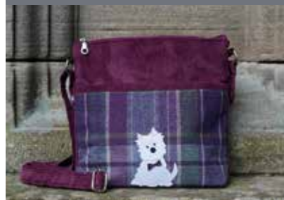
Tweed Animal Appliqué Pages 24-27