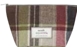
Wisteria Tweed Makeup Bag T21MUPGP