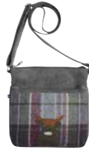
Cow Appliqué Amelia Messenger Bag AAAMCOWPQ