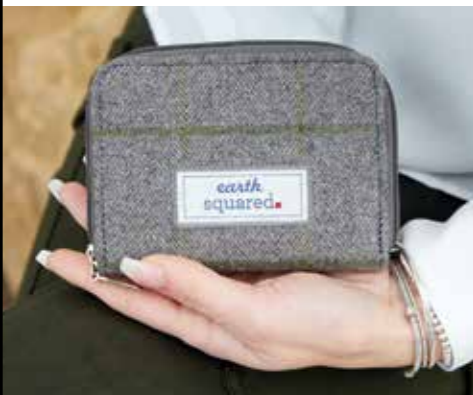
Grey Heritage Tweed Wallet TAGWAL 13cms x 10cms £23.99

Finished in simple yet sophisticated grey and forest green checked tweed.