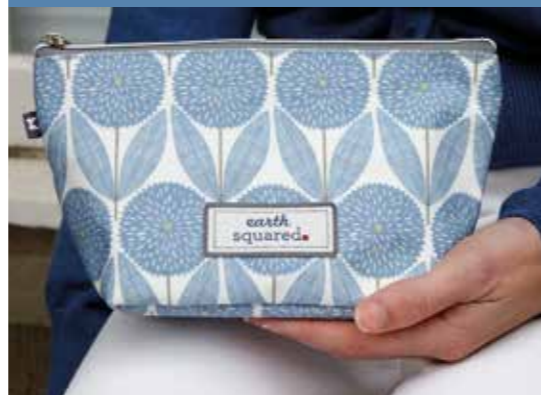
Cornflower Blue Oil Cloth Pages 20-23