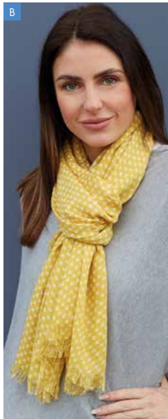
B Yellow/White Spring Cross Scarf XSCFGY