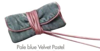
Pale blue Velvet Pastel Jewellery Roll V2OJRBLU