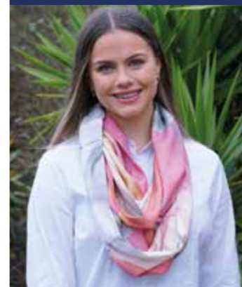
Antibes Infinity Scarf Pages 40-41