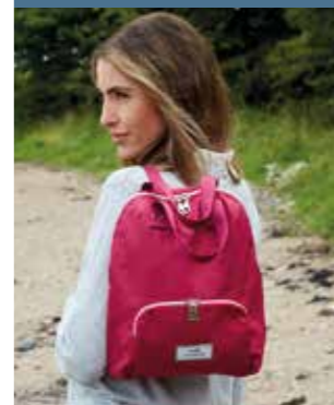
Voyage Range Pages 42-43