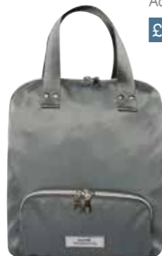
Grey Small Voyage Backpack YAGSMGY