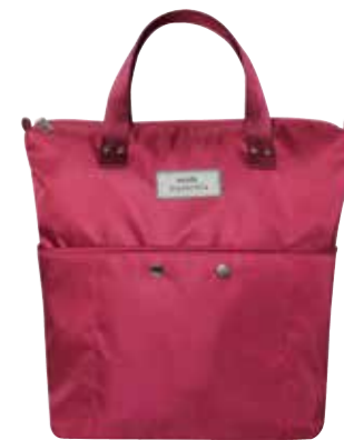
Pink Voyage Billie Backpack YAGBPPK