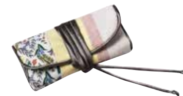
Yellow Floral Pastel Jewellery Roll PASJRYW