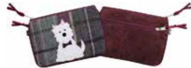
Dog Appliqué Juliet Purse PPQJPDG