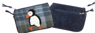
Puffin Appliqué Juliet Purse PPQJPPUF