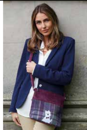
Dog Appliqué Amelia Messenger Bag PPQMDDOG