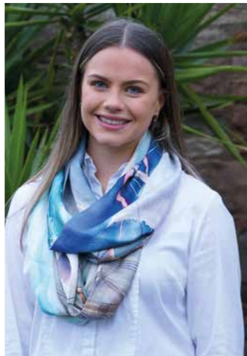
Sea Antibes Scarf ANTSEA