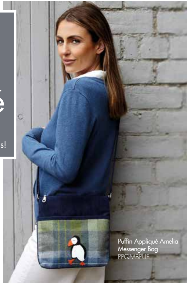
Puffin Appliqué Amelia Messenger Bag PPQMBPUF