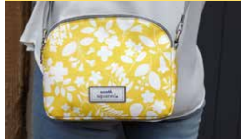
Sherbet Yellow Oil Cloth Pages 28-31