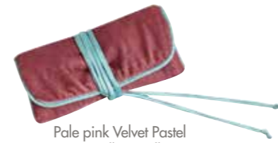
Pale pink Velvet Pastel Jewellery Roll V2OJRPINK