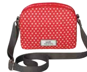
Red/White Spring Linen Half Moon Bag XMOONRD