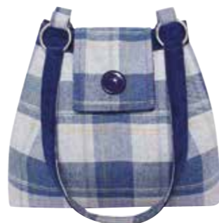
Loch Tweed Ava Bag T21AVALO