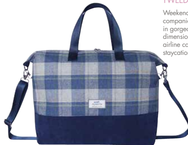
Loch Tweed Weekend Bag T21WEEKLO