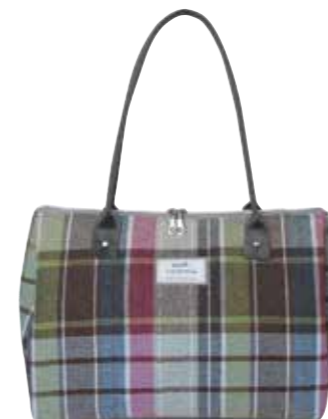
Wisteria Tweed Tote Bag T21EMTTGP