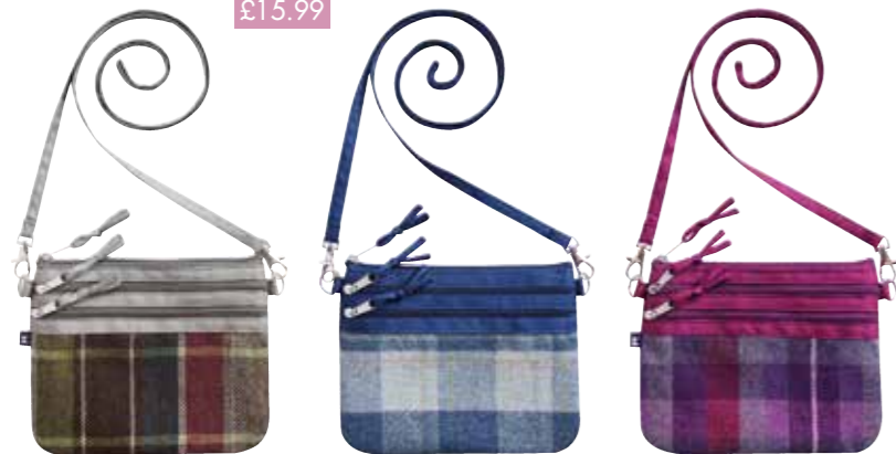
Wisteria Tweed Pouch Bag TD3ZIPGP