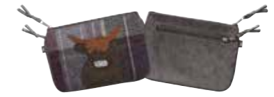
Cow Appliqué Juliet Purse AAJULCOWPQ