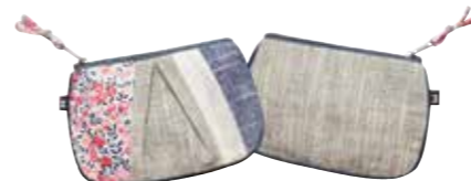
Pink Floral Pastel Pleat Purse PASPURPK