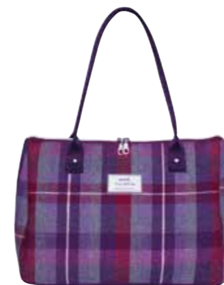
Glen Tweed Tote Bag T21EMTTGLE