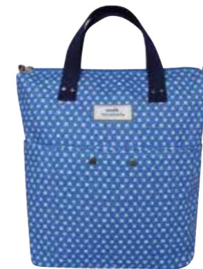
Blue/White Spring Linen Backpack XBPBL