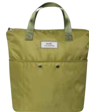
Green Voyage Billie Backpack YAGBPGN