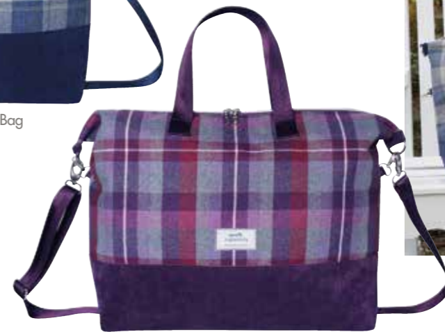
Glen Tweed Weekend Bag T21WEEKGLE