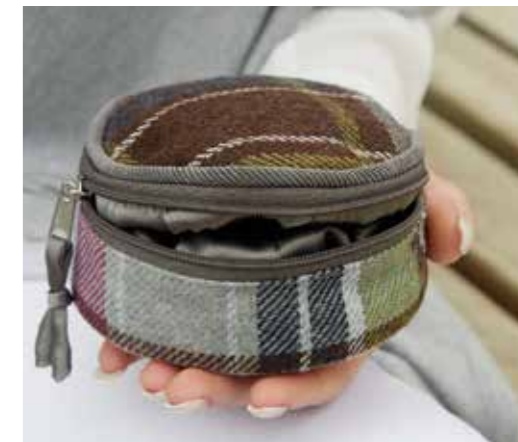
Glen Tweed Jewellery Pouch T21JRGLE