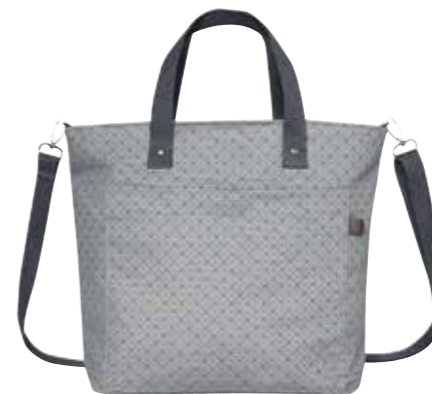
Grey Floral Canvas Tote Bag NVTTG