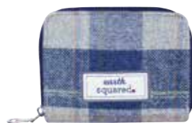
Loch Tweed Wallet T21WLLO