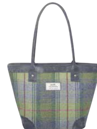
Pebble Tweed Tote Bag T19TTPB