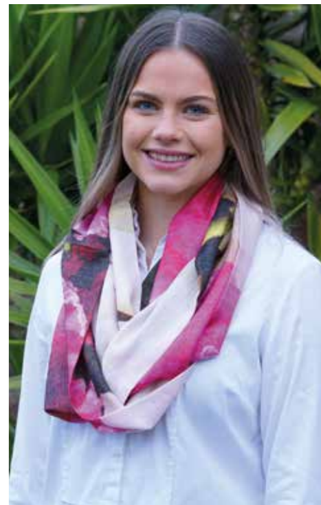
Blush Antibes Scarf ANTBL