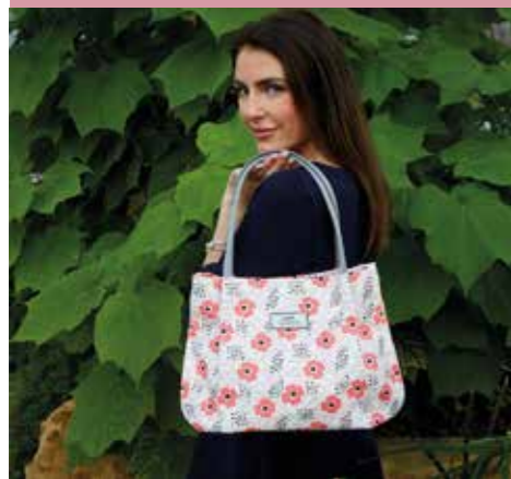
Pink Flower Oil Cloth Pages 6-10