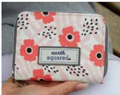
Pink Flower Oil Cloth Wallet PINWAL

This pocket sized design is finished in hard-wearing oil cloth for extra durability and looks gorgeous in this pretty pink flower print.