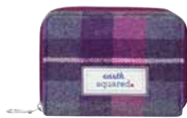
Glen Tweed Wallet T21WGLE