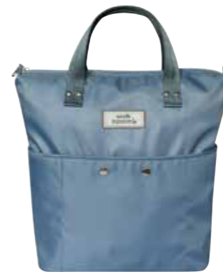
Pale Blue Voyage Billie Backpack YAGBPBL